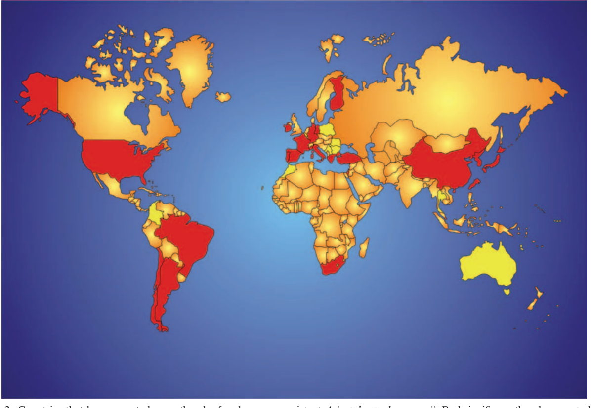
FIG. 2. Countries that have reported an outbreak of carbapenem-resistant Acinetobacter baumannii . Red signifies outbreaks reported before 2006, and yellow signifies outbreaks reported since 2006.

(42, 488). Intercontinental spread of multidrug-resistant A. baumannii has also been described between Europe and other countries as a consequence of airline travel (383, 421). These events highlight the importance of appropriate screening and possible isolation of patients transferred from countries with high rates of drug-resistant organisms.